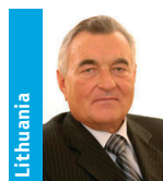
Petras Baguška Minister of Justice