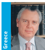
Anastasios Papaligouras Minister of Justice