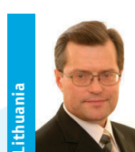
Raimondas Šukys Minister of the Interior