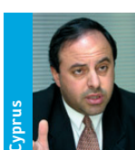
Sophocles Sophocleous Minister of Justice and Public Order