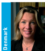
Lene Espersen Minister of Justice