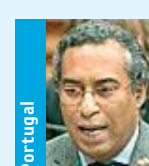
António Costa Minister of State and Internal Administration