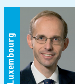
Luc Frieden Minister of Justice