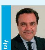
Clemente Mastella Minister of Justice