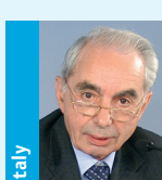
Giuliano Amato Minister of the Interior