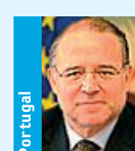
Alberto Costa Minister for Justice