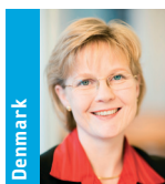
Rikke Hvilshøj Minister of Refugees, Immigration and Integration Affairs