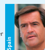
Juan Fernando López Aguilar Minister for Justice