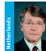
Piet Hein Donner Minister of Justice