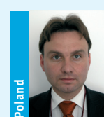
Andrzej Duda Undersecretary of State