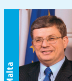
Tonio Borg Deputy prime minister, Minister for Justice and Home Affairs