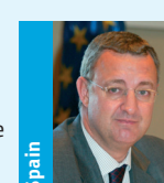
Jesús Caldera Sánchez-Capitán Minister for Labour and Social Affairs