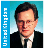
Lord Peter Goldsmith