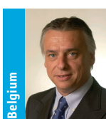
Patrick Dewael Deputy Prime Minister, Minister of the Interior