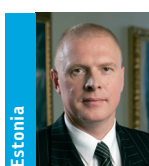
Kalle Laanet Minister of Internal Affairs