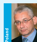
Ludwik Dorn Deputy Prime Minister, Minister of Interior and Administration