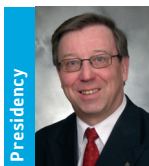
Kari Rajamäki Minister of the Interior