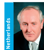
Johan Remkes Minister of the Interior and Kingdom Relations