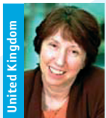
Baroness Catherine Ashton