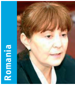
Monica Luisa Macovei

Minister for Migration and Asylum Policy