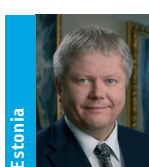
Rein Lang Minister of Justice