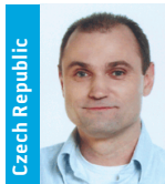
Ivan Langer Minister of the Interior, Minister of Informatics