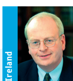
Michael McDowell Minister for Justice, Equality and Law Reform