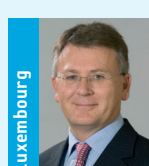
Nicolas Schmit Minister Delegate of Foreign Affairs and Immigration