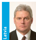
Dzintars Jaundžeikars Minister for the Interior