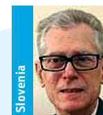
Lovro Štuřm Minister of Justice