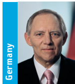
Wolfgang Schäuble Federal Minister of the Interior