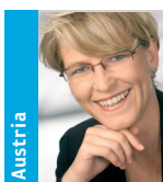
Karin Gastinger Federal Minister of Justice