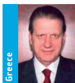
Vyron Polydoros Minister of Public Order