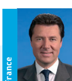
Christian Estrosi Minister Delegate for Regional Development