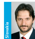
Robert Kalinák Deputy Prime Minister, Minister for the Interior