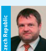
Roman Polásek Deputy Justice Minister